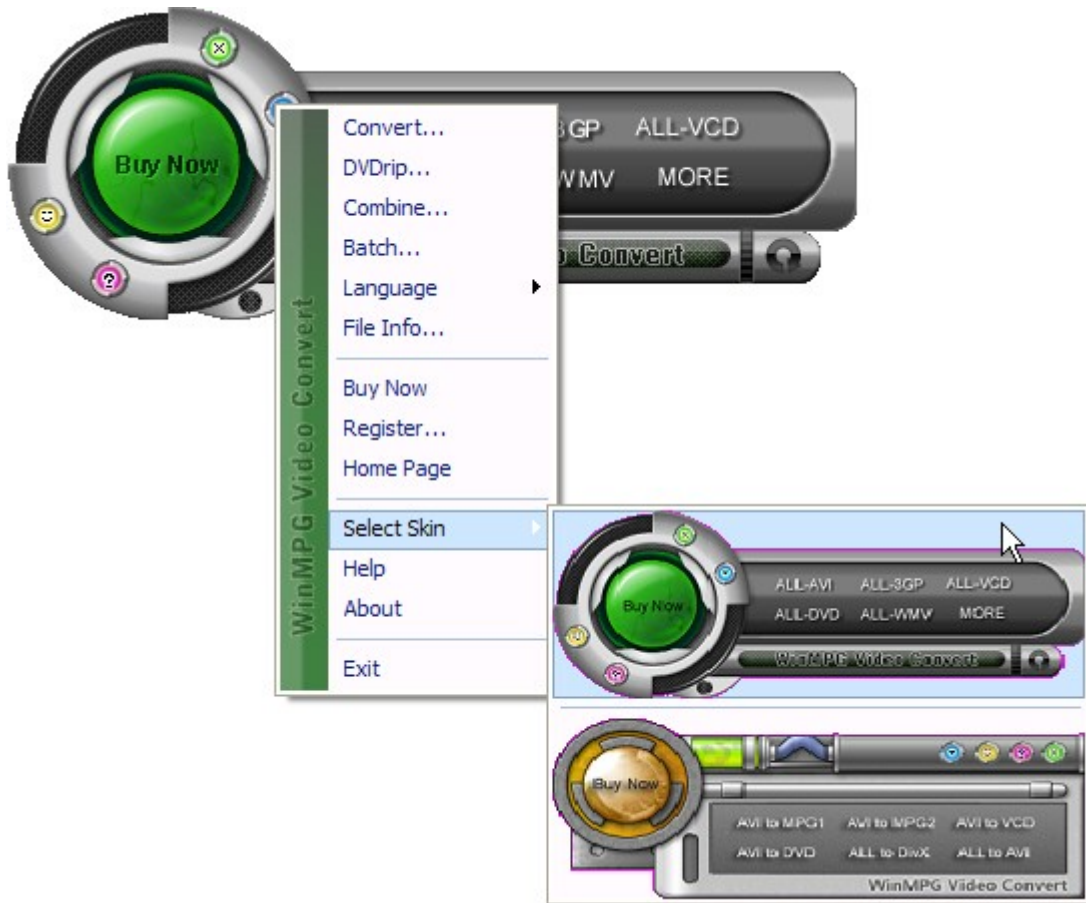
Img0: Main interface