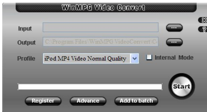
Img3: Select the input file

3. Convert dialog, select the input file: