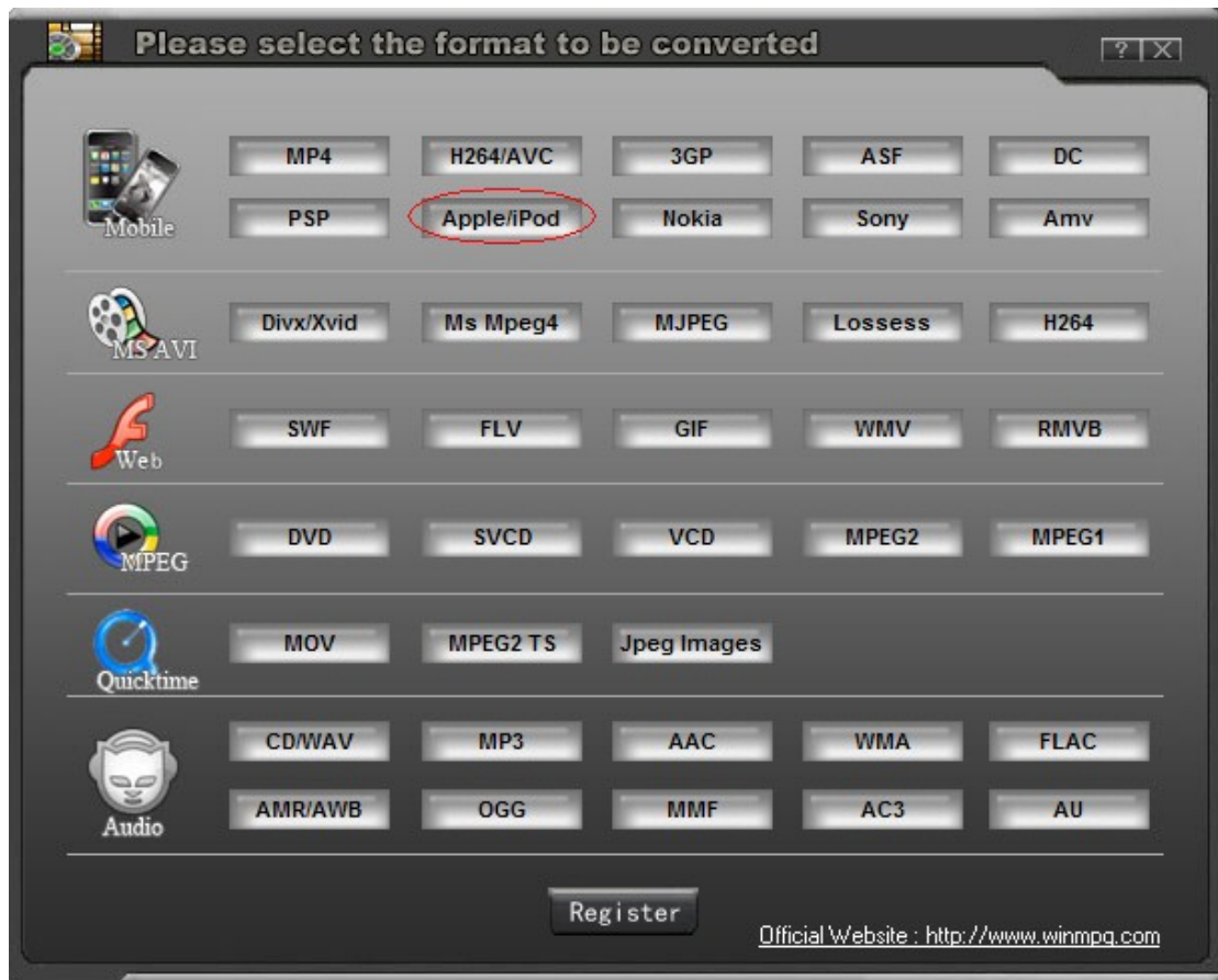
Img2: Select the format to be converted

3. Convert dialog, select the input file: